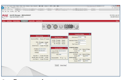
Configure and route.

Artel and Dimetis have partnered to offer a complete NMS and scheduling solution for your DigiLink media transport network. Dimetis BOSS LINK Manager® simplifies engineering, planning and operation of networks independently from the infrastructures deployed. Users can create and deliver services across wide area networks in seconds, through a simple graphical user interface. Scheduling, network performance, fault management, and the discovery capabilities of BOSS LINK Manager® combined with the